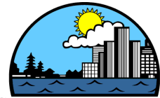
Citizens Environment Alliance